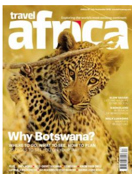
CRAIG RIX TRAVEL AFRICA JULY-SEPTEMBER 2019