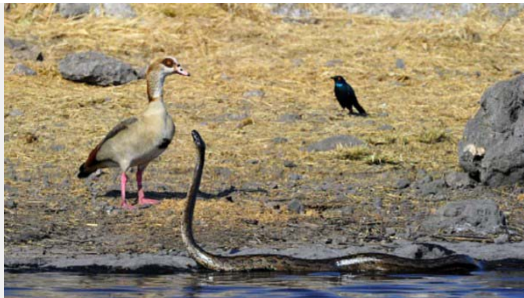
Photographed between Halali and Namutoni

The authors and photographers of The Photographer’s Guide to Etosha National Park are clearly passionate about their subject. This shows in every photograph and in the detailed ‘how to’ explanation on each page. They want to share their passion for wildlife and photography with the world and they do it well. They do it with care and simplicity so that amateur or even more challenged photographers like me can understand and learn. Yet it is clearly going to be an invaluable reference for the experienced photographer.